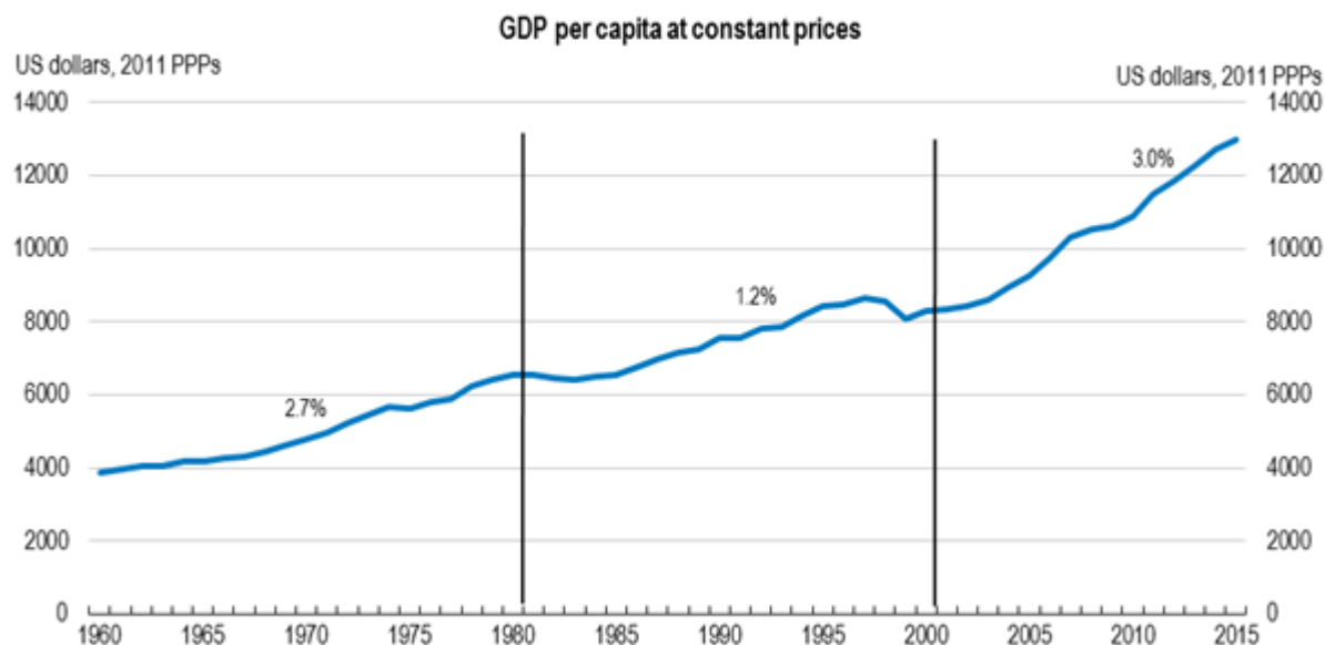
Figure 1. Living standards have improved